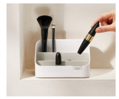
Tiered design for quick and easy access