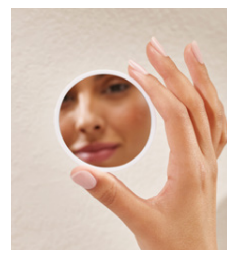
Compact, magnetic 3x magnifying mirror with non-scratch back