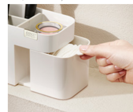
Drawer with magnetic closures for cotton wool pads, cotton buds and make-up sponges