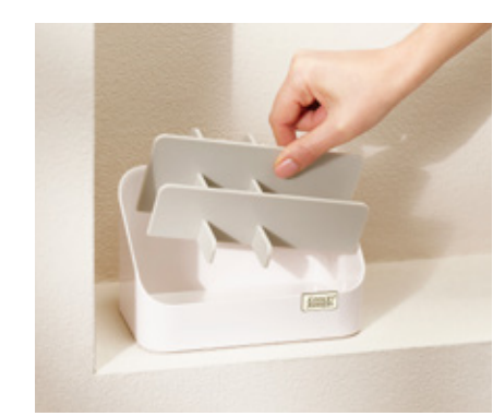
Dismantles for easy cleaning