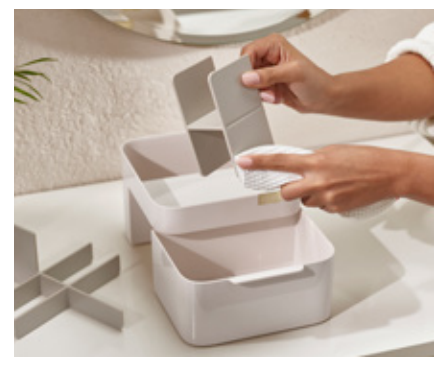
Dismantles for easy cleaning