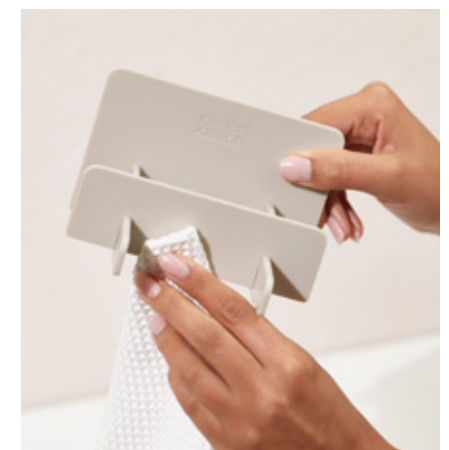
Removable divider for easy cleaning