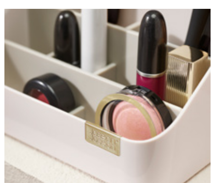
Ideal for storing regularly used items such as make-up brushes, eye-liners and nail varnishes